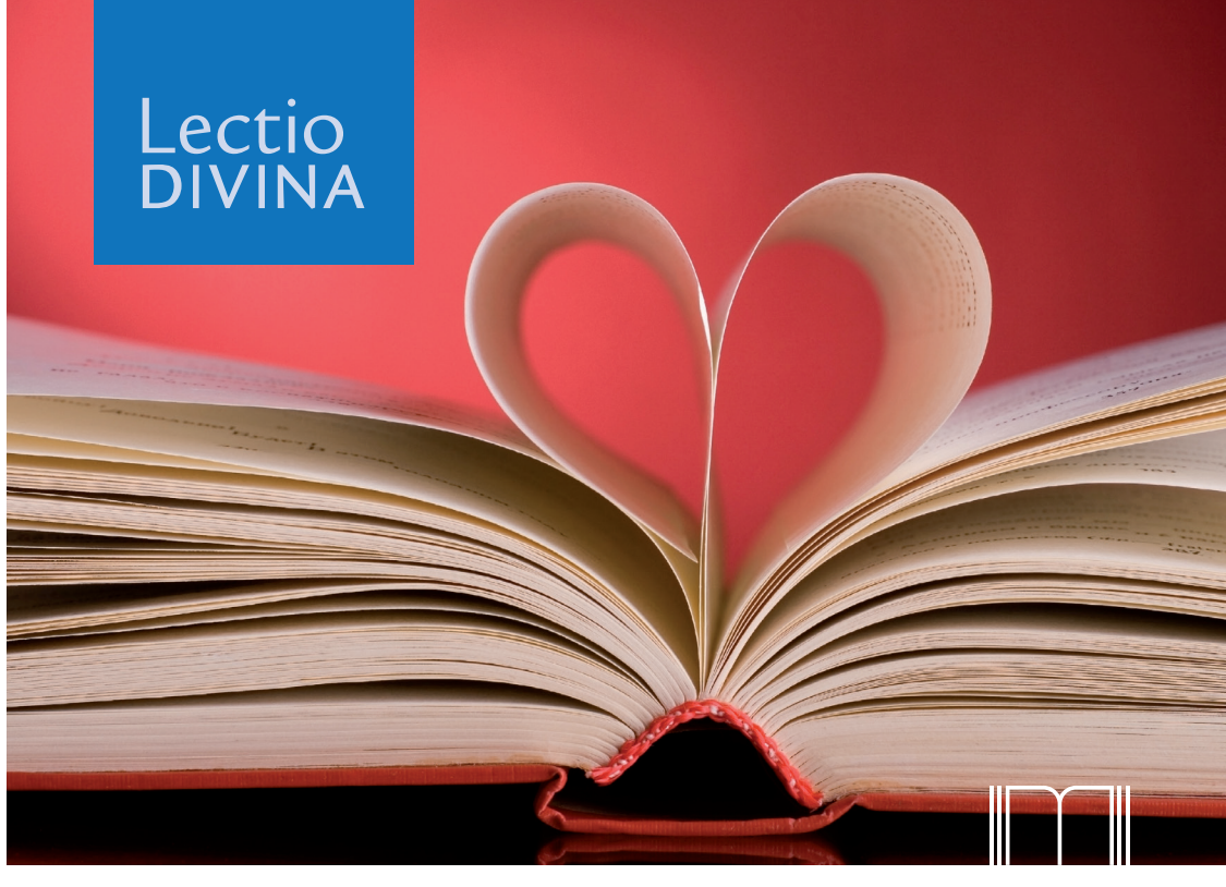
Das Lectio-Divina-Projekt des Bibelwerks